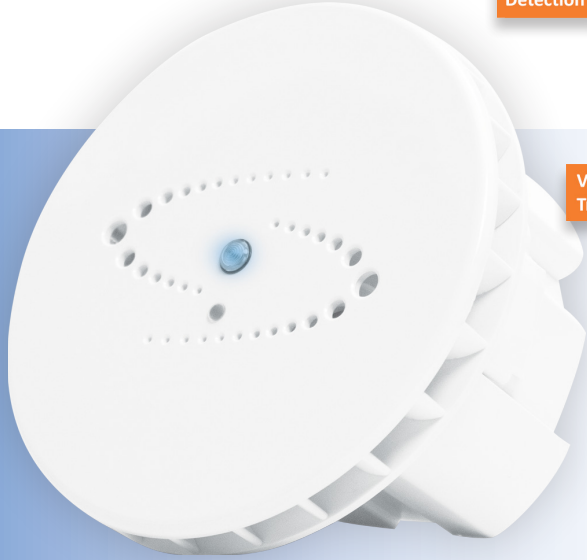
HALO Smart Sensor is Patented.